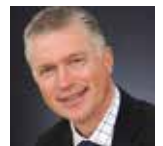
FRAIN Best Overall Student

The celebratory reception was a fitting end to all the hard work, and provided the opportunity for students to catch up with one another and celebrate their achievements in the company of their