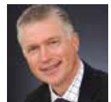
FRAIN Best Overall Student

The celebratory reception was a fitting end to all the hard work, and provided the opportunity for students to catch up with one another and celebrate their achievements in the company of their